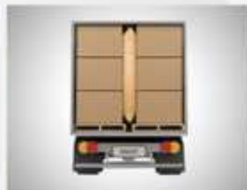
Dunnage Air Bag