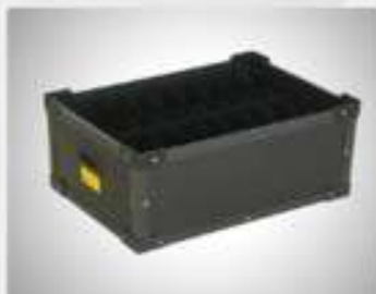
PP Box With Partition