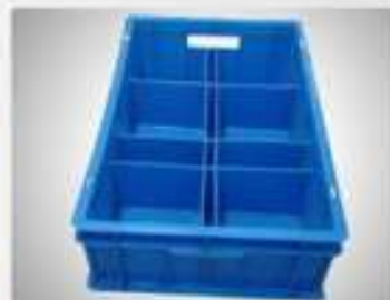
Plastic Bin With Partition