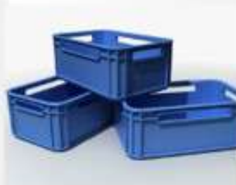
Plastic Moulded Bin