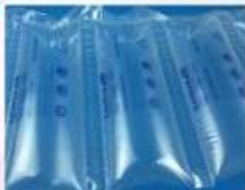
Fill Air Bag