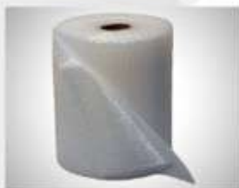
Air Bubble Roll