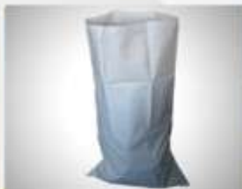
HPE Woven Sack