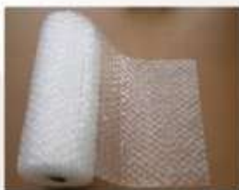
20 mm Dia Roll