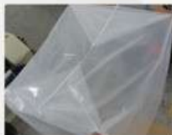
5 Sided Bag