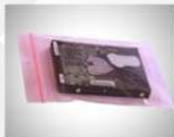
Antistatic LD Cover