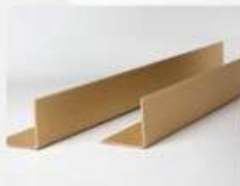
Angle Edge Board